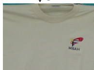
5380 - Youth