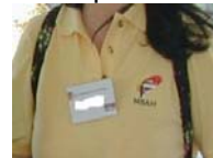
L420 - Yellow