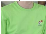
PC61 - Adult