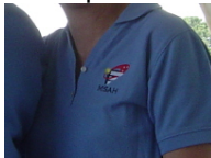
L448 – Blueberry